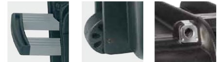
Two Man Lift Side Handles